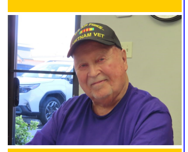
Frosty celebrates Veteran's Day